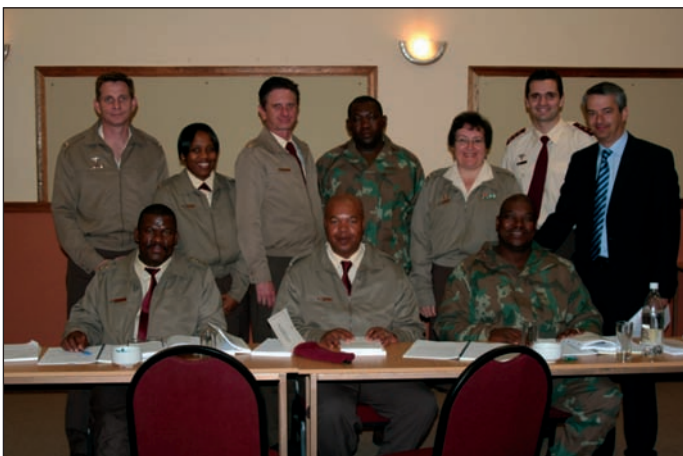
Figure 5. Syndicate of the first regional LOAC Course in the Republic of South Africa