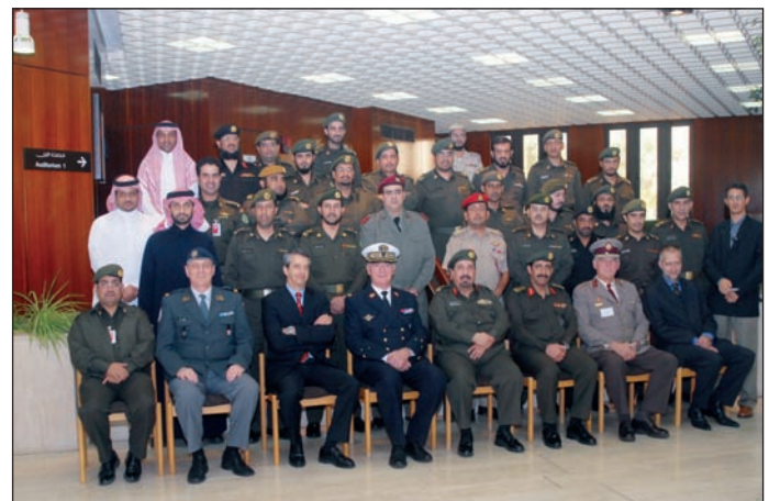
Figure 6. Course Picture of the first regional LOAC Course in the Kingdom of Saudi Arabia